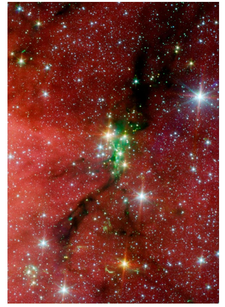
Composite image of the Serpens-South star formation region.