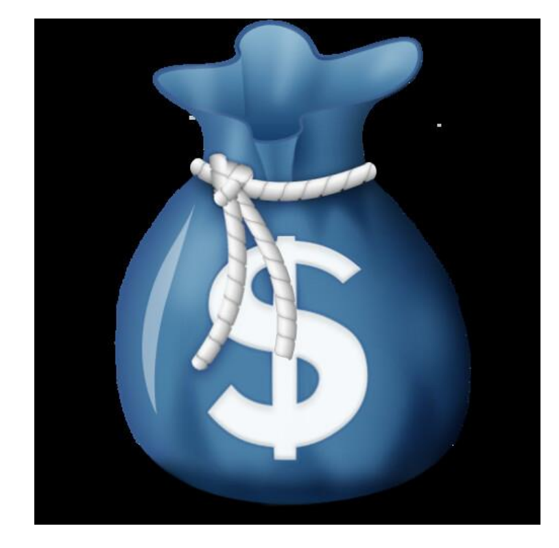
"Money Bag in Blue"